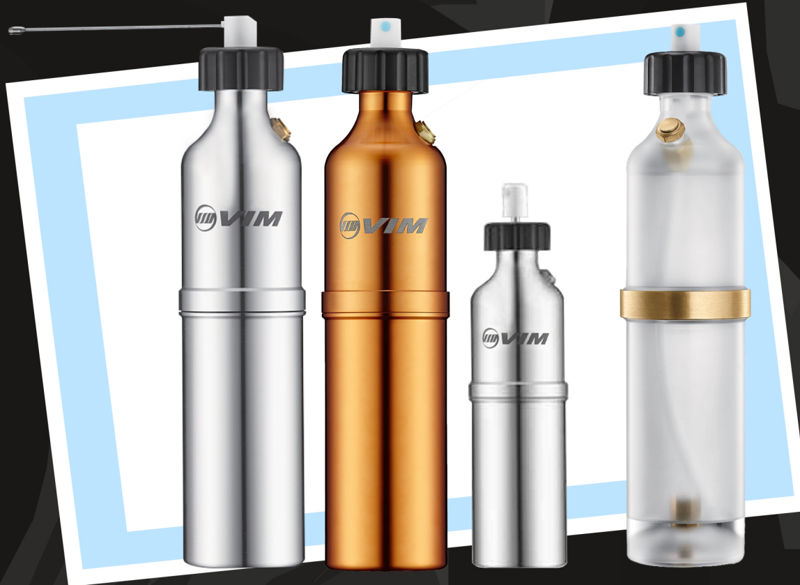
Demo. Spray can